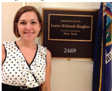
Digestive health advocate Crystal poses outside of Rep. Slaughter's office during the 2013 DHA Advocacy Day.

Since the 113th Congress began in January, over 3,000 bills have been introduced in the U.S. House of Representatives. So it takes a lot to make any one piece of legislation stand out from the crowd. For three Members of Congress, digestive health advocates have managed to do just